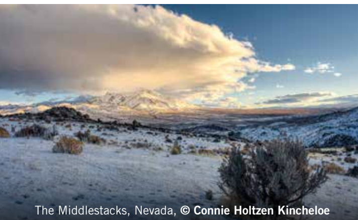
The Middlestacks, Nevada