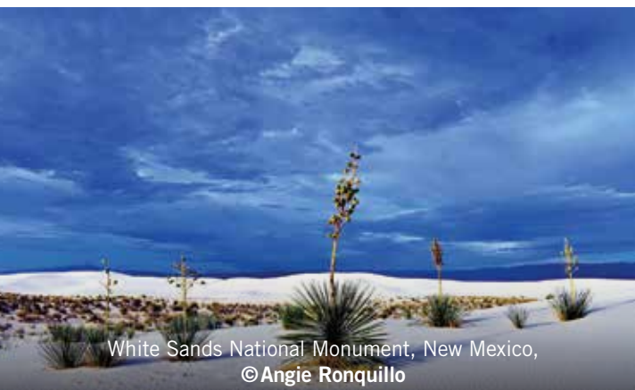
White Sands National Monument, New Mexico