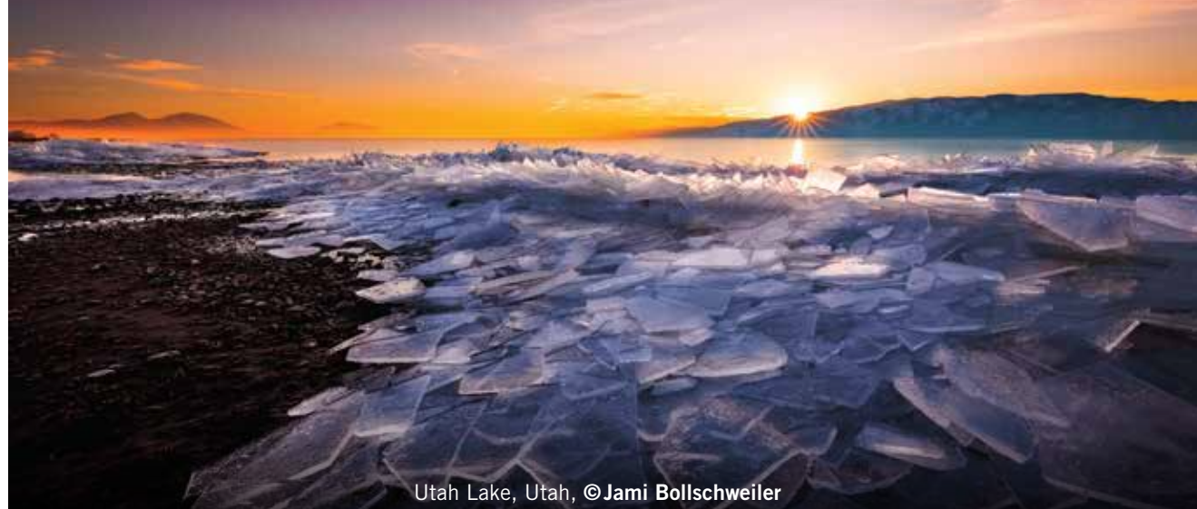
Utah Lake, Utah, © Jami Bollschweiler