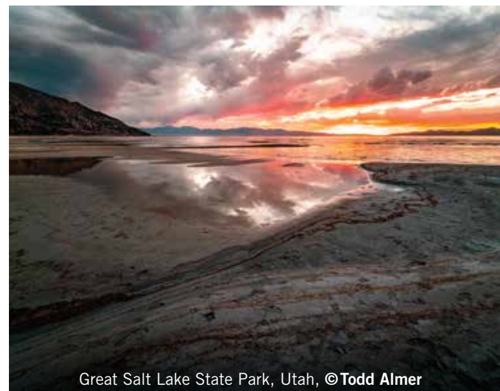
Great Salt Lake State Park, Utah, © Todd Almer