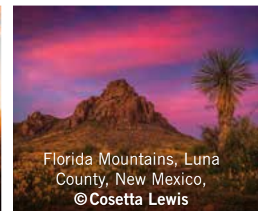
Florida Mountains, Luna County, New Mexico, © Cosetta Lewis