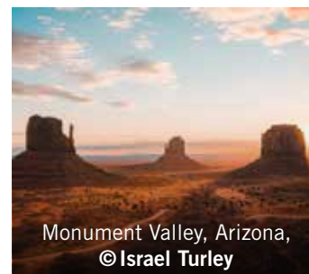
Monument Valley, Arizona