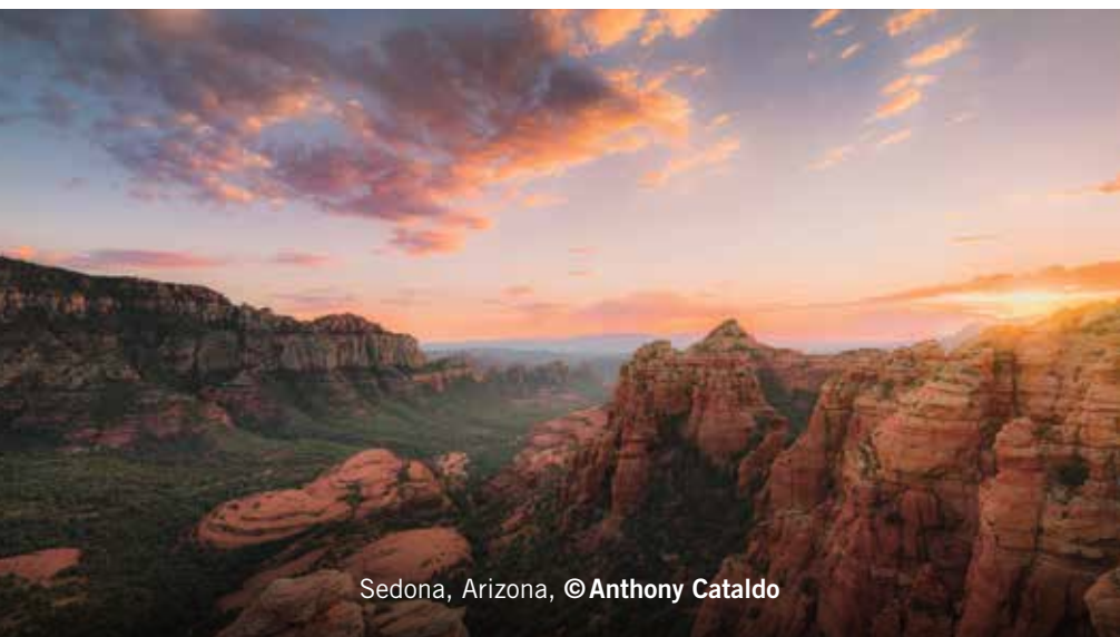
Sedona, Arizona