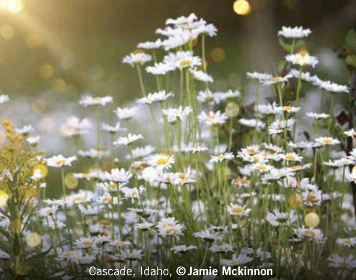
Cascade, Idaho