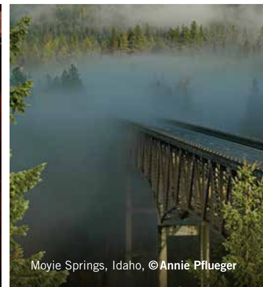
Moyie Springs, Idaho